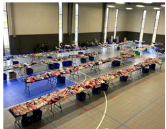
Back to School Giveaway this fall.

'Back to School' is a time of year when families spend a lot of money preparing for school. Extending Grace plans to provide new backpacks and school supplies to over 180 families this year . Help Extending Grace to alleviate some of the financial burdens for these families.