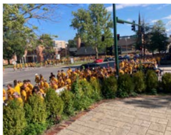
Moments before passing out popsicles to incoming freshmen at our Downtown campus.

We want to be generous because Christ has been generous with us. Your focused financial giving in this area will allow us to offer students a meal to share Christ's love and tell them more about our biblical community .